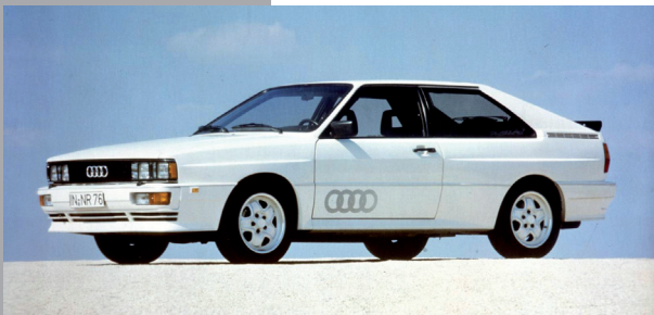
The Audi Ur-quattro: the pioneer with the first standard all-wheel drive in a sports coupe - and of course with Fuchs wheels.